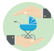
Child Saving Schemes