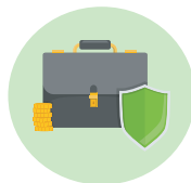
Company Fixed Deposits