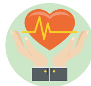
Critical Illness Insurance