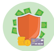
SIP - Systematic Investment Plans