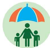
Life Insurance (Term Plans)