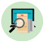
Tax Saving Schemes