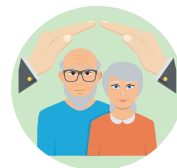
Retirement & Pension Schemes