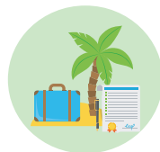
Capital Gain Bonds